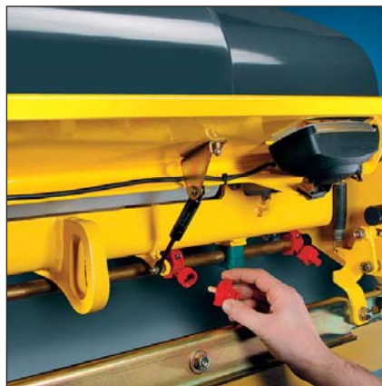
All weather performance: spray nozzles are wind-protected but are still easily accessible.

BOMAG provides local service and support no matter where your next contract is located.