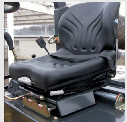
Option: lateral shifting seat; twin travel lever available.