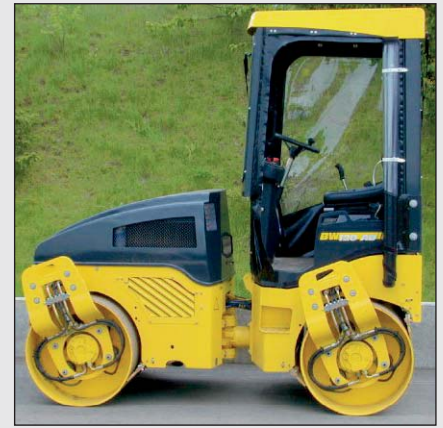
Option: all-weather protected cab

All models are standard equipped to a full specification but a range of options are available: a foldable ROPS provides an alternative to rigid roll over protection. Users appreciate the simple design on site. The edge compactor system from BOMAG includes a conical pressure roll designed for compaction close up to walls without the need for a second follow-up machine.