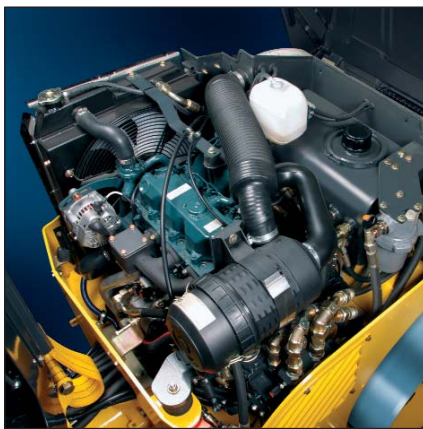
Easy and quick to service: everything has easy access.

In addition there are extended service intervals, e.g. 2,000 hours or 2 years for hydraulic oil and filter. BOMAG compaction technology looks after your money.