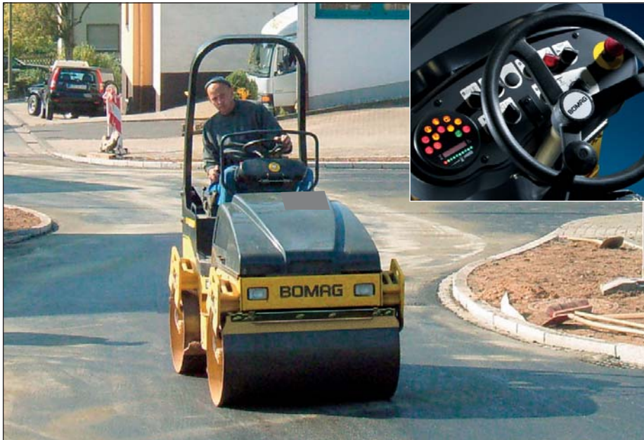
BW 120 AD-4: vibration insulated operator's platform; good visibility across sloped engine hood and angled support legs.

The combination rollers BW 100 AC-4, BW 120 AC-4 and BW 125 AC-4 are specialist asphalt models. They combine the high compaction output from the drum with the excellent surface sealing from the 4 rear rubber wheels.