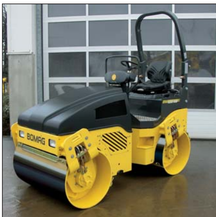
BW 125 AD-4: operating weight over 3 t.