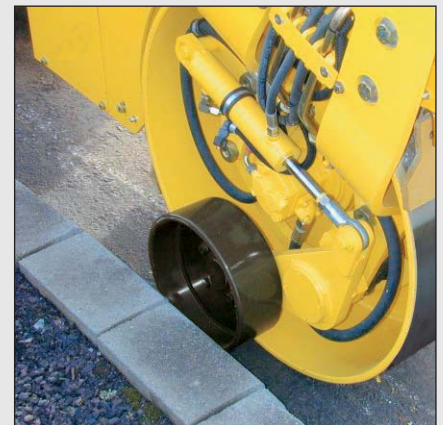
Option: edge compactor; compacts close up to curb edge.