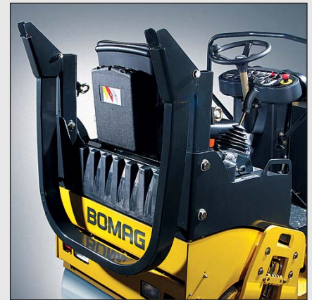
Option: folding ROPS