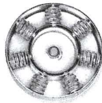
346374 C4 cutters