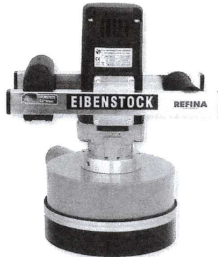
356560F dustex hood