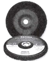
300180 ATX stripper disc