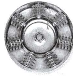
346375 C5 cutters