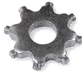
C6 tungsten tipped cutters for render & masonry