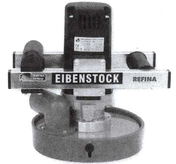
EPO180H-ATX multi-surfacer & stripper