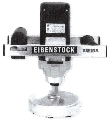
EPO180H-SRX6 surface scabbler