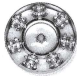
346376 C6 cutters